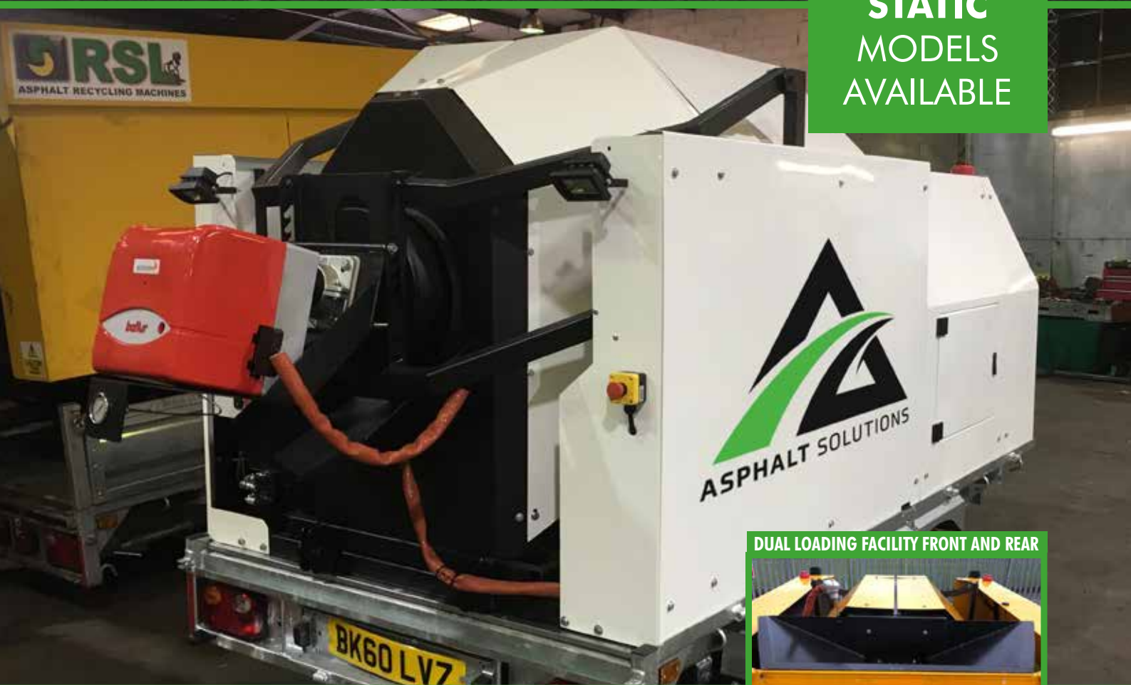
DUAL LOADING FACILITY FRONT AND REAR