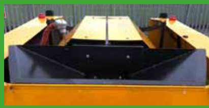
DUAL LOADING FACILITY FRONT AND REAR