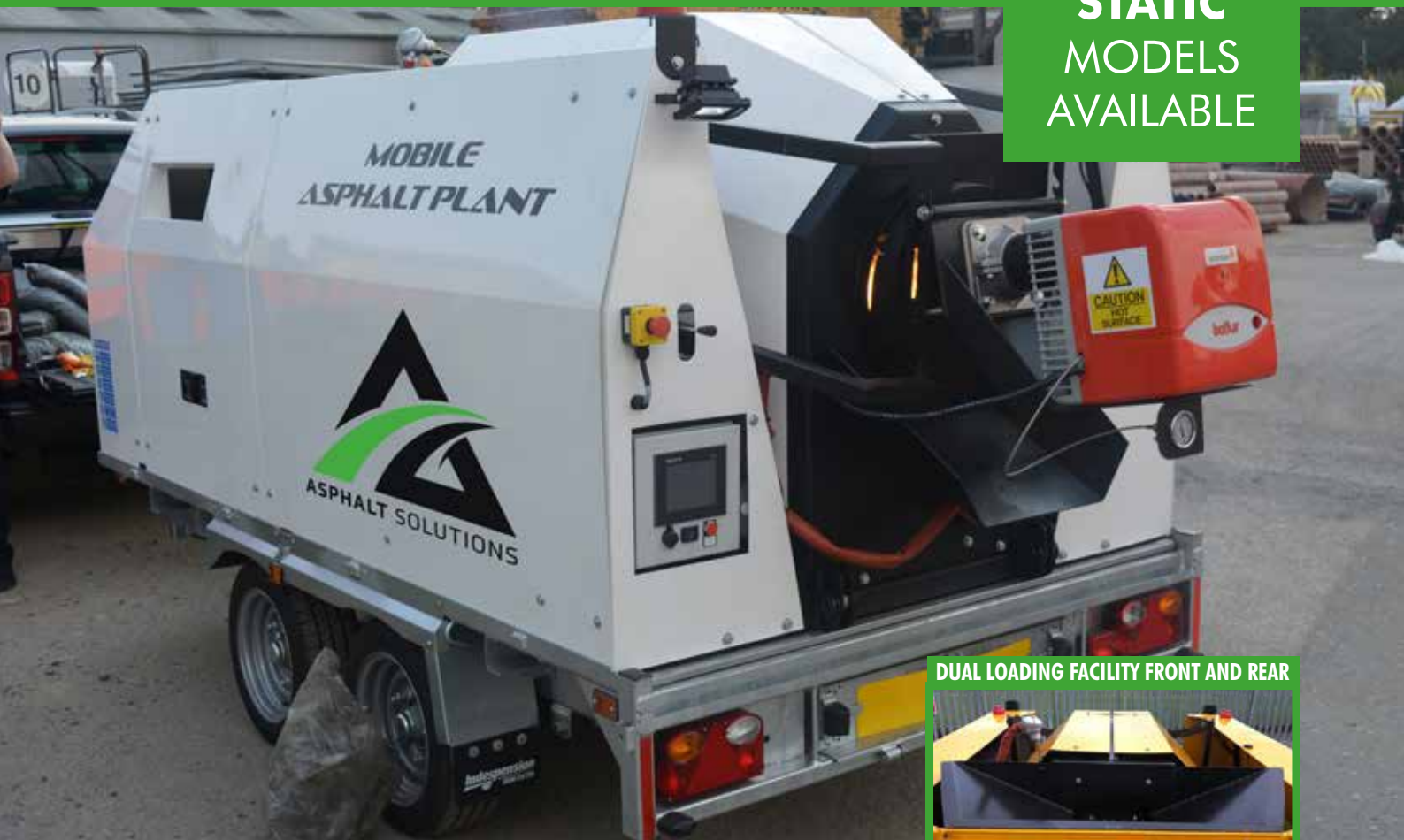
DUAL LOADING FACILITY FRONT AND REAR