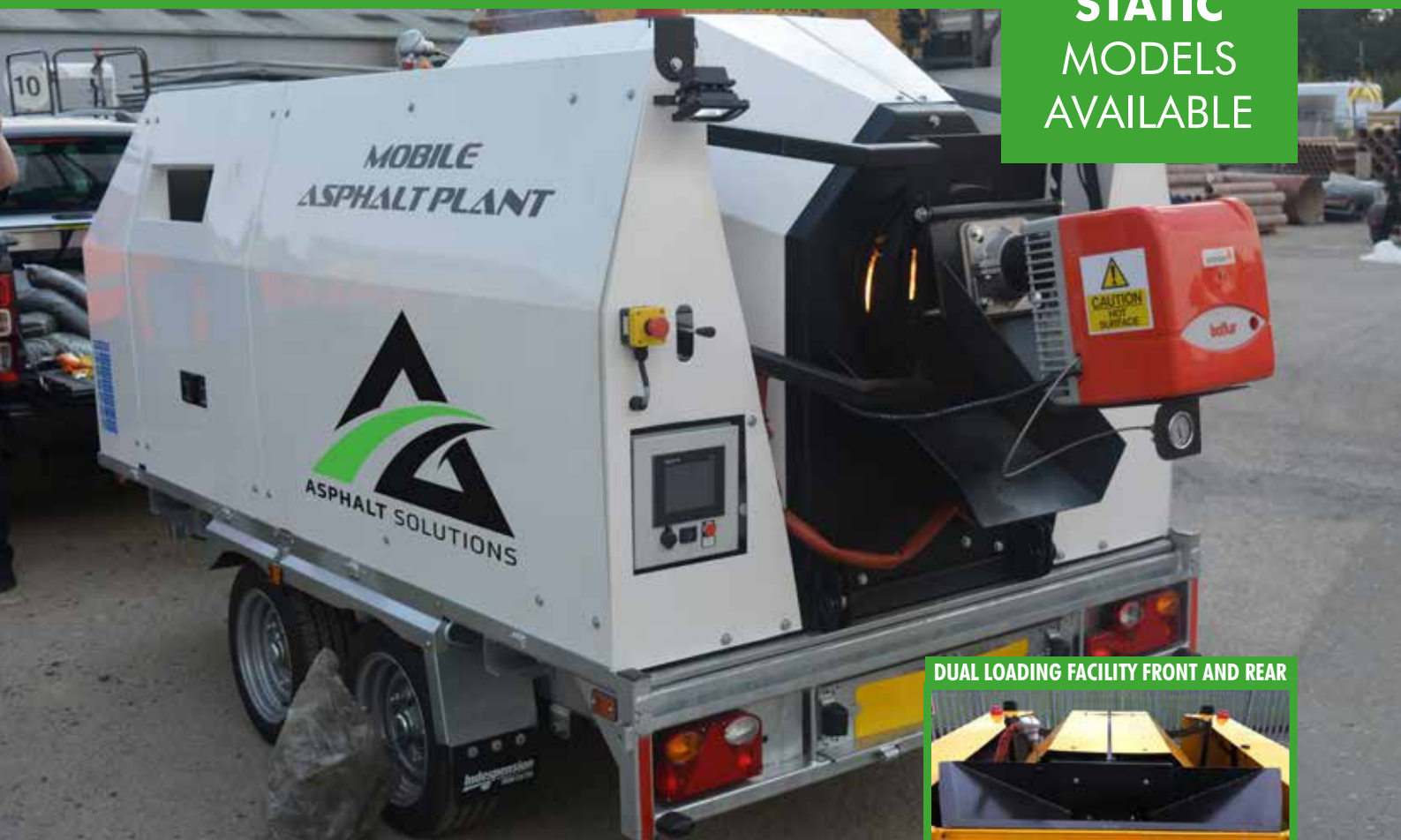
DUAL LOADING FACILITY FRONT AND REAR